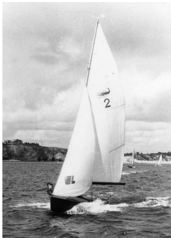
Scorpion No.2 on a tight two sail reach