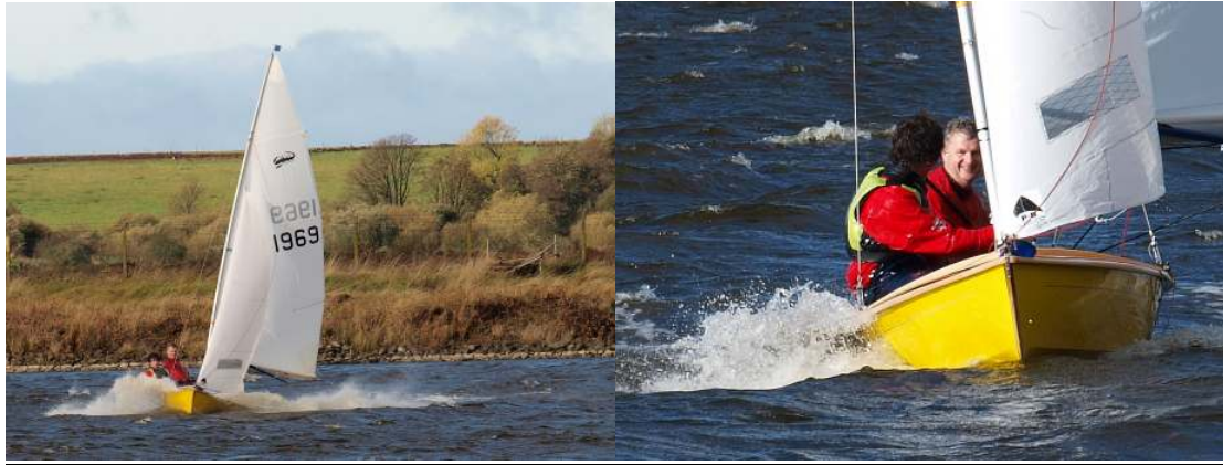
Ade looks a bit relieved following another frantic reach